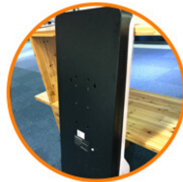
Back View Metal Housing