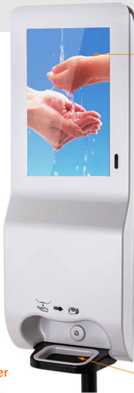
21.5" WiFi Video Player